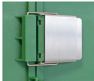
Brushed stainless steel closures

The cabinet is well sealed and equipped with brushed stainless steel hinges and closures, which makes it resistant to all weather conditions.